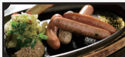
Assortment of sausages