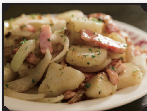
Sauteed potato with bacon and onion over roasted

Sauteed potato with bacon and onion over roasted ..... ¥680 (German cuisine)